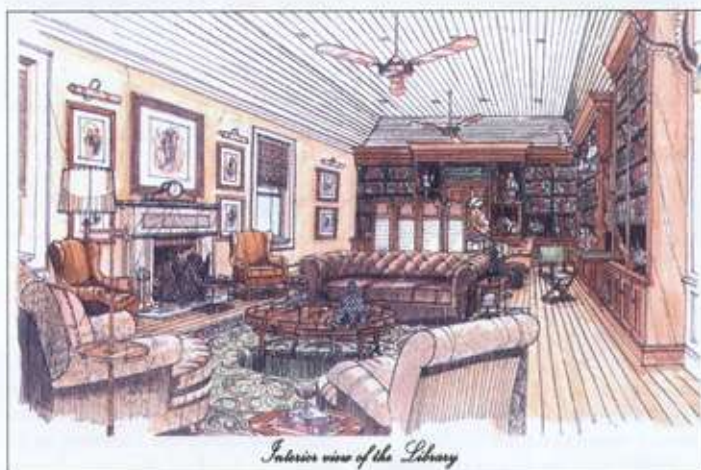
Interior view of the Library