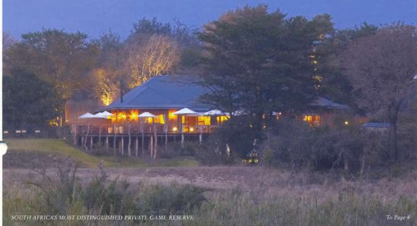
SOUTH AFRICA'S MOST DISTINGUISHED PRIVATE GAME RESERVE