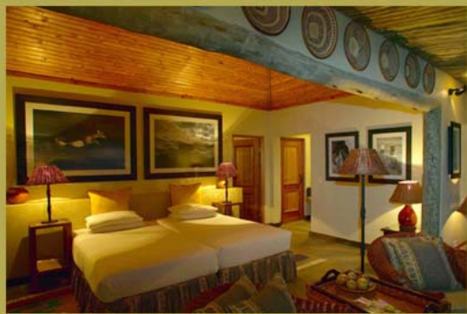
Mashatu Main Camp