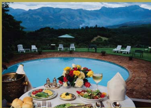
The Coach House